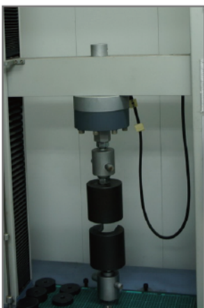
Tensile Strength Tester