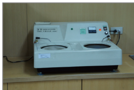
Grinder and Polisher